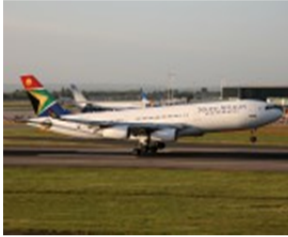
South African Airways

Travel Dates: March 8, 2012 – March 18, 2012 Your Culturally Rich Journey to the Motherland!