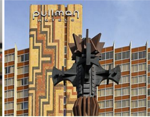
Pullman Teranga Hotel